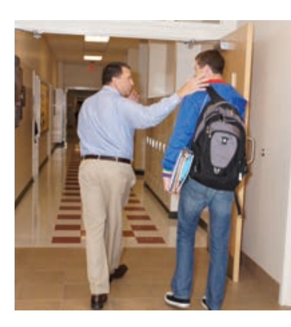
Increasing Understanding Through Education